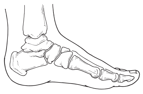
Normal pediatric foot

Pediatric flatfoot can be classified as symptomatic or asymptomatic. Symptomatic flatfeet exhibit symptoms such as pain and limitation of activity, while asymptomatic flatfeet show no symptoms. These classifications can assist your foot and ankle surgeon in determining an appropriate treatment plan.