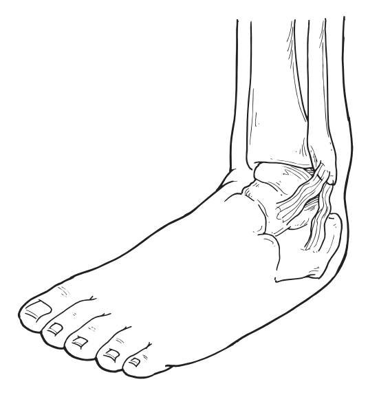
Injured ankle with laxity of ligaments

Chronic ankle instability usually develops following an ankle sprain that has not adequately healed or was not rehabilitated completely. When you sprain your ankle, the connective tissues (ligaments) are stretched or torn. The ability to balance is often affected. Proper rehabilitation is needed to strengthen the muscles around the ankle and "retrain" the tissues within the ankle that affect balance. Failure to do so may result in repeated ankle sprains.